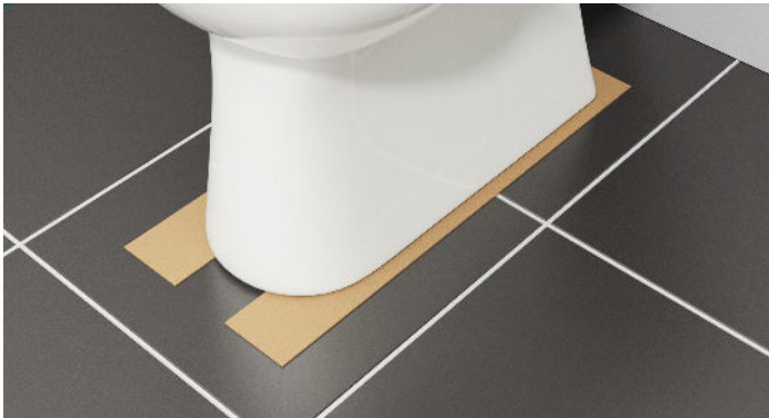
Place and glue the toilet seat onto the two REGUFOAM® WC-Strips