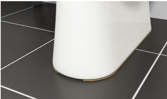
Cut off the excess strips using a knife and then seal with a silicone adhesive around the toilet.