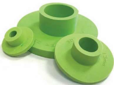
3D Isolation Washer for mounting with screws.